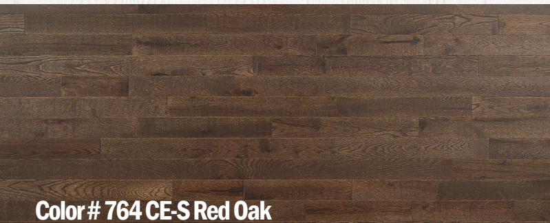
Color # 764 CE-S Red Oak