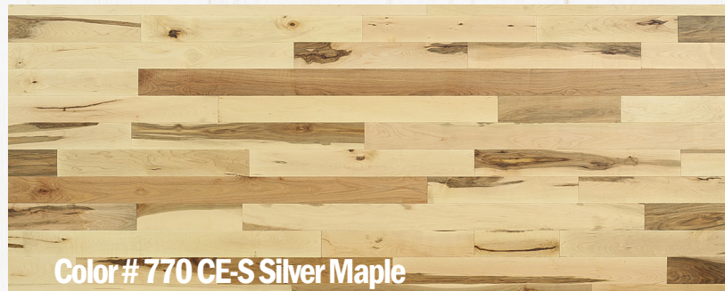
Color # 770 CE-S Silver Maple