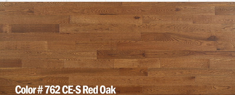
Color # 762 CE-S Red Oak