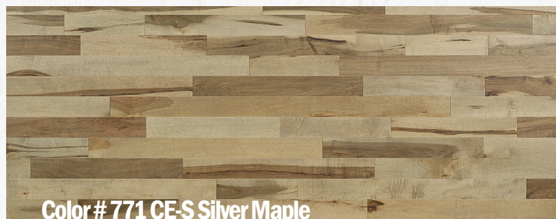
Color # 771 CE-S Silver Maple