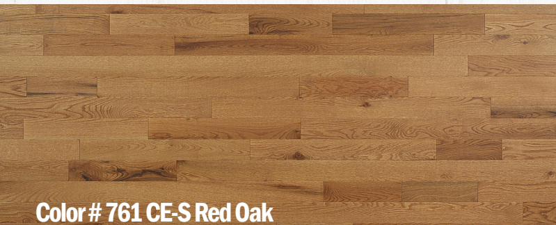
Color # 761 CE-S Red Oak