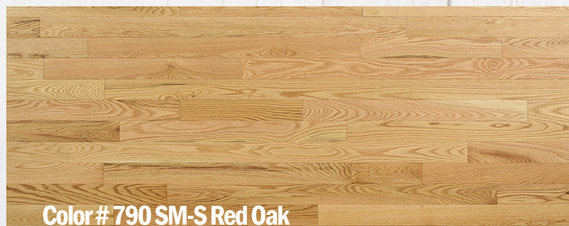
Color # 790 SM-S Red Oak