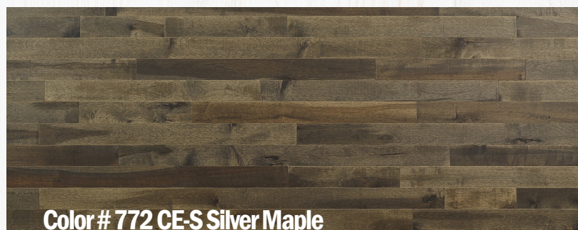
Color # 772 CE-S Silver Maple