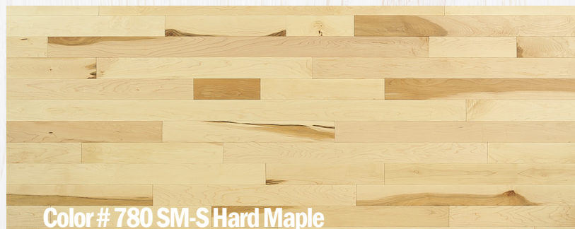
Color # 780 SM-S Hard Maple