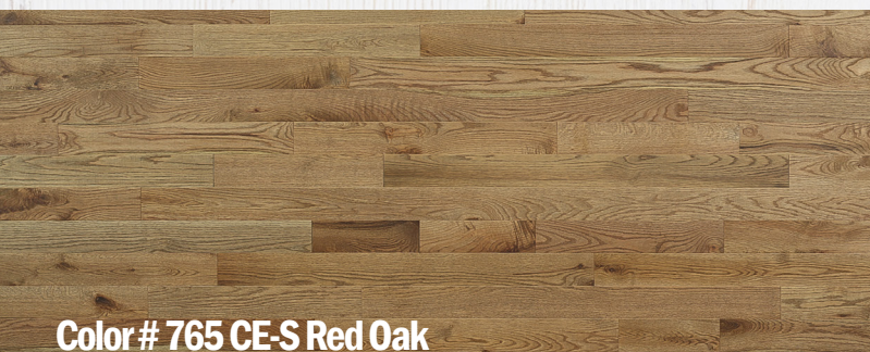
Color # 765 CE-S Red Oak