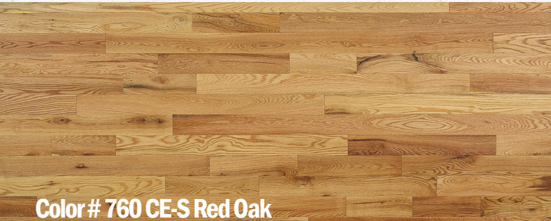
Color # 760 CE-S Red Oak