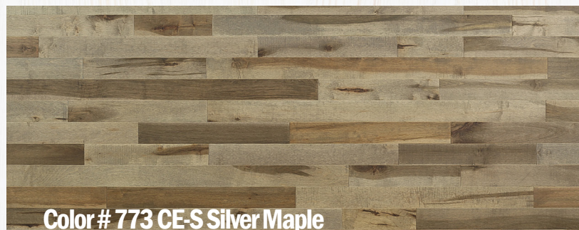
Color # 773 CE-S Silver Maple